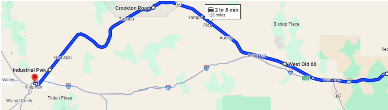
Figure 3 CLICK ON MAP FOR LINK TO GOOGLE MAPS